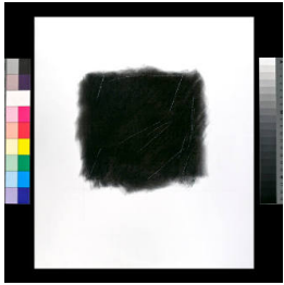
Title: Hidden Sounds 4 Date: 1977 Primary Maker: Edda Renouf Medium: incised lines and pastel chalk on Arches paper with fixative