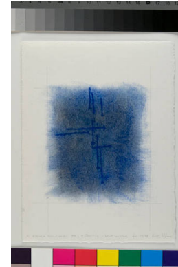
Title: A Visible Sounds Date: 1978 Primary Maker: Edda Renouf Medium: graphite, incisions and blue pastel chalk on Arches paper with fixative